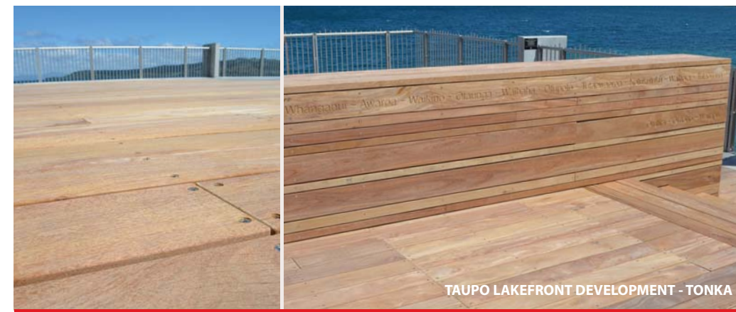
TAUPO LAKEFRONT DEVELOPMENT - TONKA

From its early origins in the 1930's, Rosenfeld Kidson has been importing hardwoods from around the world for heavy construction and infrastructure projects, such as bridge, wharf and railway construction and hardwood poles and crossarms for power reticulation. However, there has been an increased demand for durable hardwoods for both domestic and commercial landscaping projects, as well as boardwalks around parks, reserves and waterfronts.