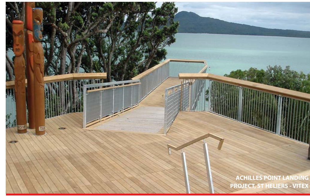
ACHILLES POINT LANDING PROJECT, ST HELIERS - VITEX

Postal Address: P O Box 621 Shortland Street Auckland 1140