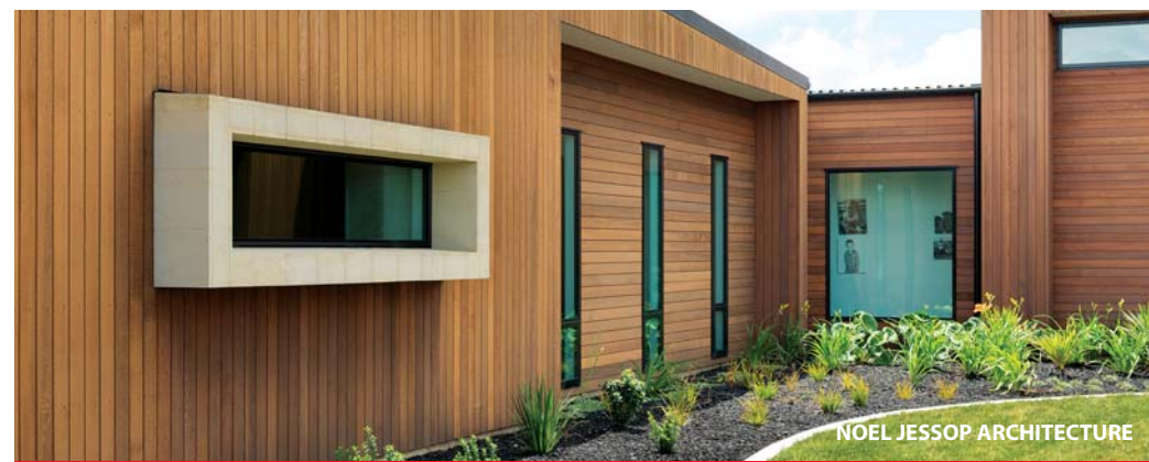
NOEL JESSOP ARCHITECTURE

Rosenfeld Kidson stocks more than 30 species of specialist timbers suitable for furniture manufacture, cabinetmaking, interior joinery and boatbuilding. Most of these species are available in 25, 40, 50 and 75mm thicknesses in a range of fixed or mixed widths.