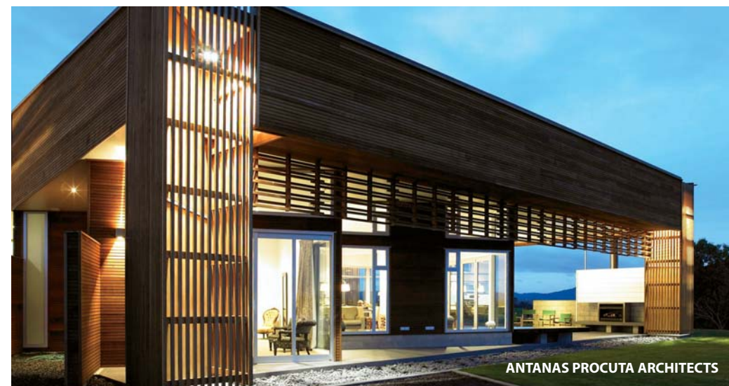
ANTANAS PROCUTA ARCHITECTS