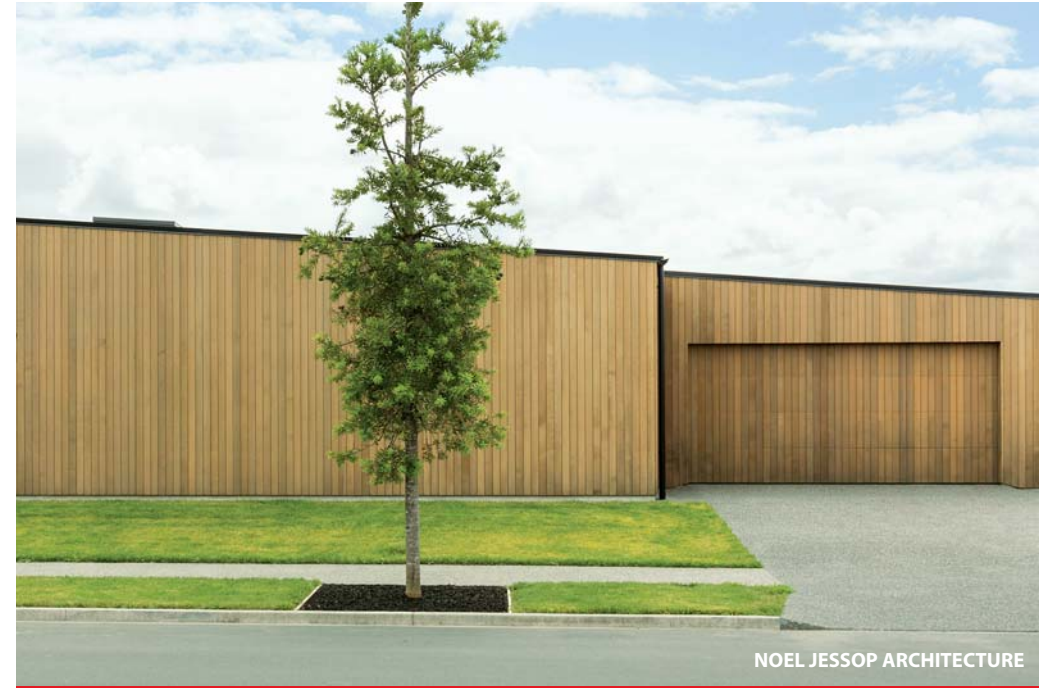
NOEL JESSOP ARCHITECTURE